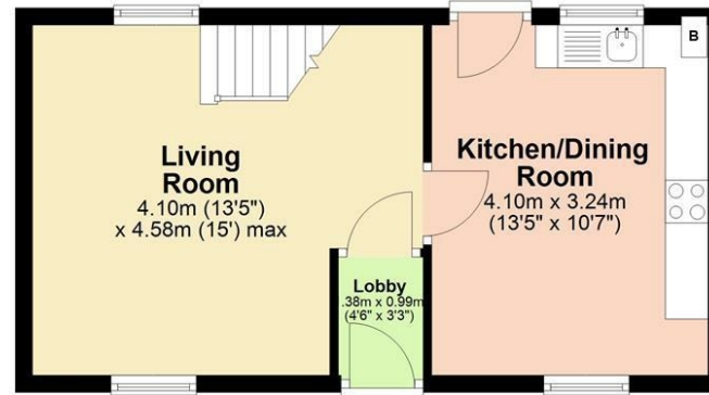
First Floor Approx. 29.0 sq. metres (312.6 sq. feet)